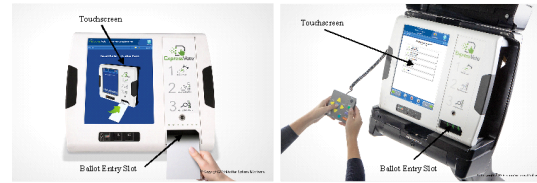
INSTRUCTIONS ON HOW TO VOTE ON AN EXPRESSVOTE VOTING SYSTEM

The ExpressVote is a ballot-marking system that is available for anyone to use during the upcoming election. Its main purpose is to allow voters with disabilities and other special needs to mark a ballot privately and independently.